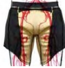
Protection of Femoral Arteries