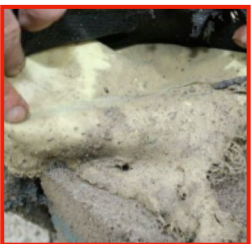
Fragmentation penetrated only 1 layer