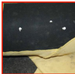
Zero trauma to femoral artery area