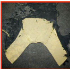
Result from 15kilo charge - Material still intact