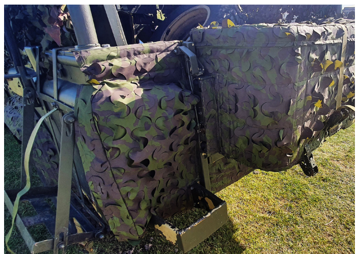
Cars, armoured vehicles, lorries, tanks...

The panels are available in bespoke sizes as a rapid and easily-attached system that protects vehicles during transport and whilst waiting for deployment.