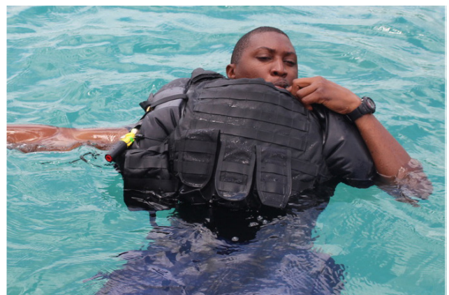
Export licence needed for all Body Armour

Unique 4 point expansion system allows the life jacket to inflate without crushing your chest